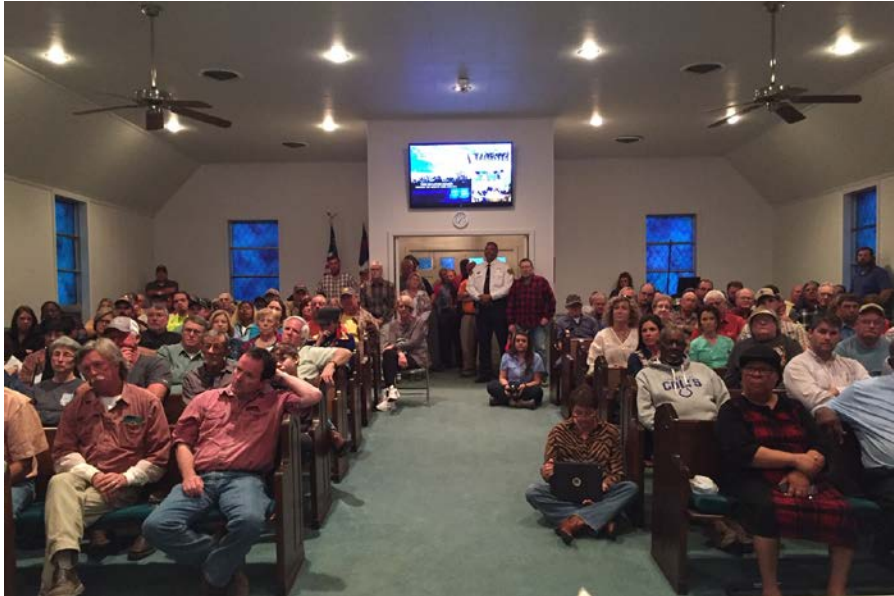
Holly Bluff, MS- Public Meeting – March 12, 2019