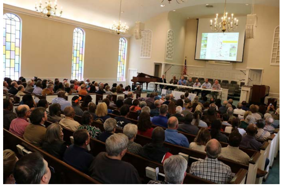
Rolling Fork, MS- Public Meeting – March 18, 2019