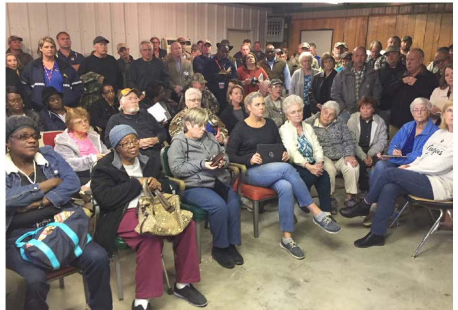
Valley Park, MS- Public Meeting – March 7, 2019