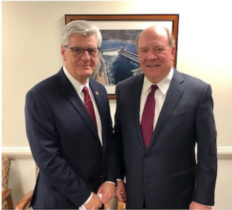
Governor Bryant with Assistant Secretary of the Army for Civil Works, R. D. James, this week in Washington

“The Army Corps of Engineers continues to support the installation of the pumps. They believe after seven different reviews and studies, that the pumps would have substantial impact in the flooding in the Mississippi Delta, and we have the total and complete support of the Corps of Engineers, and now that the review is beginning, I am extremely encouraged that the pumps in the Yazoo Backwater area may be installed.” – Governor Phil Bryant