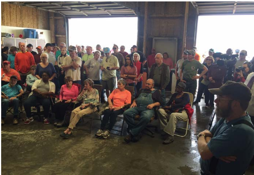
Eagle Lake, MS - Public Meeting – February 23, 2019